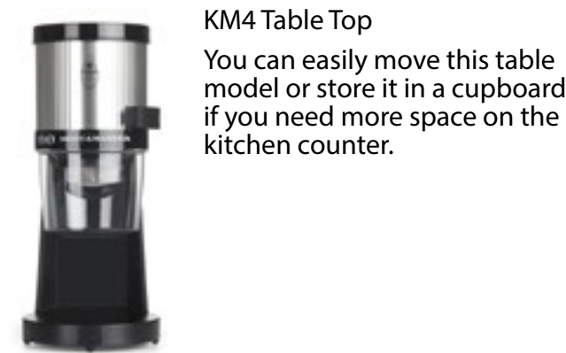
KM4 Table Top You can easily move this table model or store it in a cupboard if you need more space on the kitchen counter.