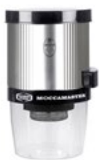
KM4 A compact coffee grinder that requires little space on the wall.