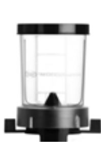
DOS Dispenser This dispenser is mounted on the wall, to be used as a coffee canister for ground coffee. With each click you dose 12 g in the filter holder, without spilling ground coffee.