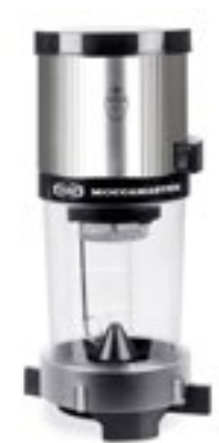
KM/DOS Grind beans and dose coffee with one device, which is mounted on the wall. 12 g of coffee can be dosed per click, directly into the filter basket, without spilling. The ground coffee does not come in contact with the outside air.